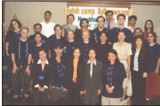
(Volunteers and teachers at the English Camp)

On July 25 th , Representatives from FGCC along with 8 Modesto Junior College students participated in the Ratanawapee English Camp held at the Nong Khai Rubber Research Station. There were 253 excited Thai students from 13 participating schools. The volunteers conducted one hour learning classes such as Communication, Go to the Market, Family Tree,