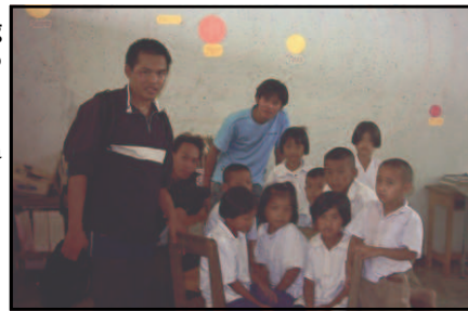
(FGCC students with the school children)